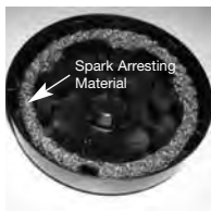
check for spark arresting optional material

Note: The spark arresting material inside the spark cover is optional.