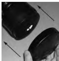
motion for attaching spark cover