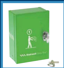
Belay Box and Bolt 6400-030-000