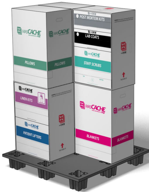
MasCache POD (MCPD4), (MCPD5), (MCPD6)